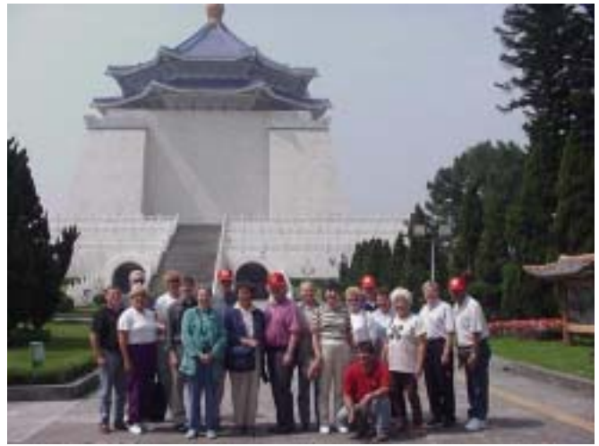
2/71 Group at Chiang Kai-shek Memorial