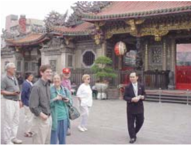
2/71 Group at Lungshan Temple, Taipei