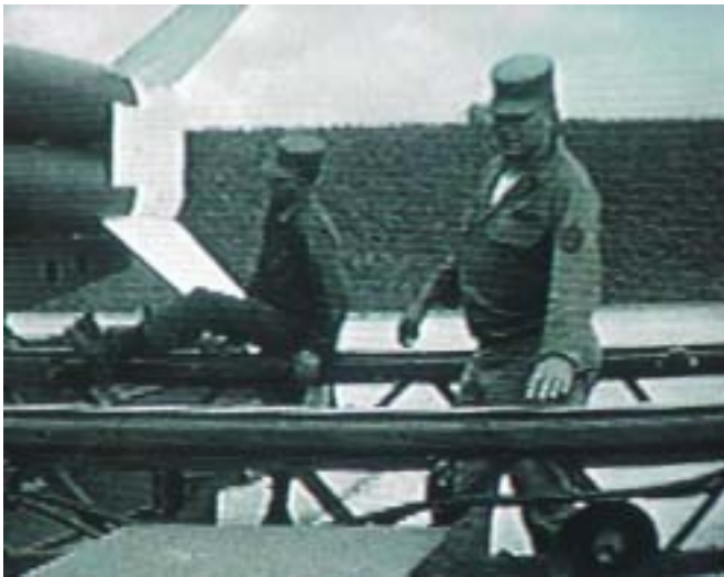
2nd Missile Bn. Launcher Troops (#3)