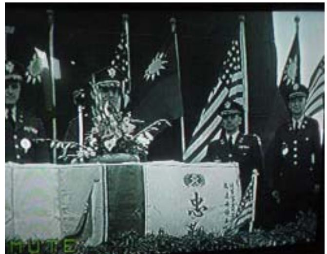
U.S. Officers on Reviewing Stand for parade of U.S. Army and R.O.C. Army Troops