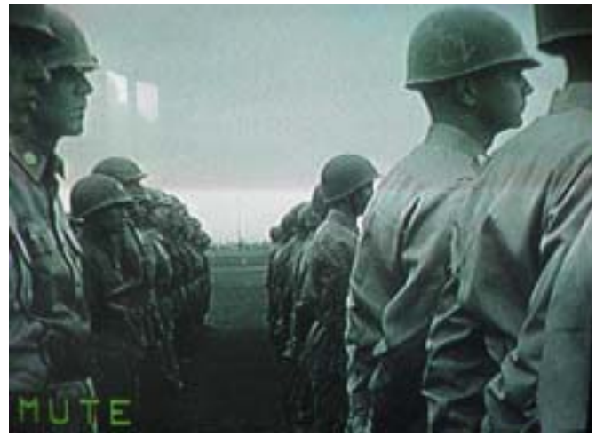
2nd Missile Bn. Troops at the Parade (#1)