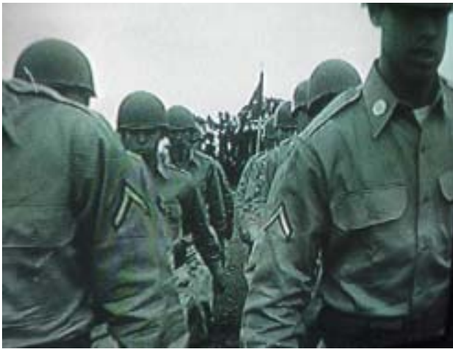
2nd Missile Bn. Troops at the Parade (#6)