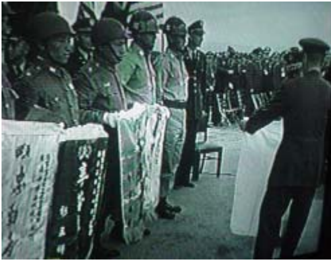
R.O.C. Officer Presenting Banners at the Parade