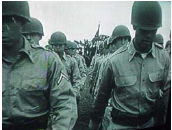
2nd Missile Bn. Troops at the Parade (#7)