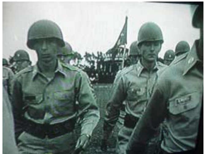
2nd Missile Bn. Troops at the Parade (#9)