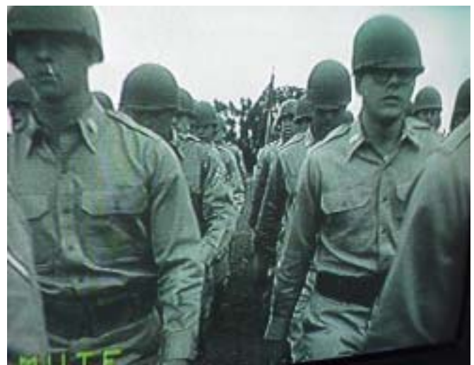
2nd Missile Bn. Troops at the Parade (#5)