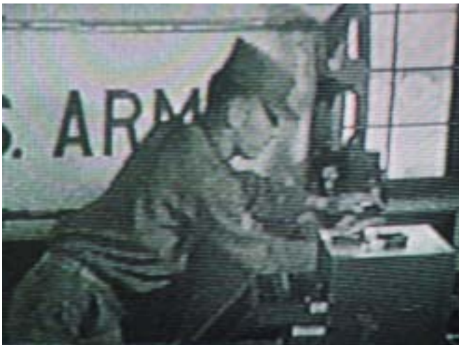
178th Ord Det Maintenance Troops (#2)