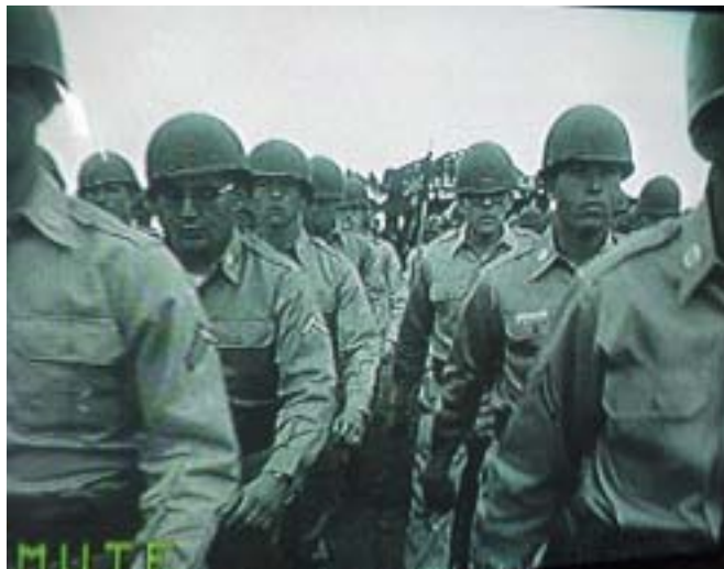
2nd Missile Bn. Troops at the Parade (#4)