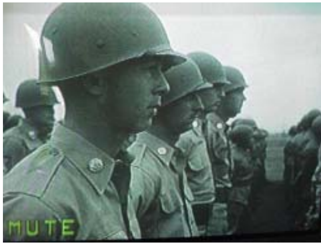
2nd Missile Bn. Troops at the Parade (#2)