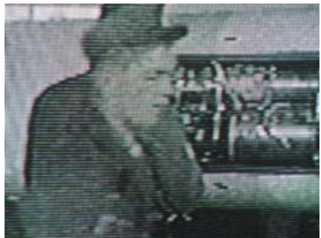
178th Ord Det Maintenance Troops (#3)