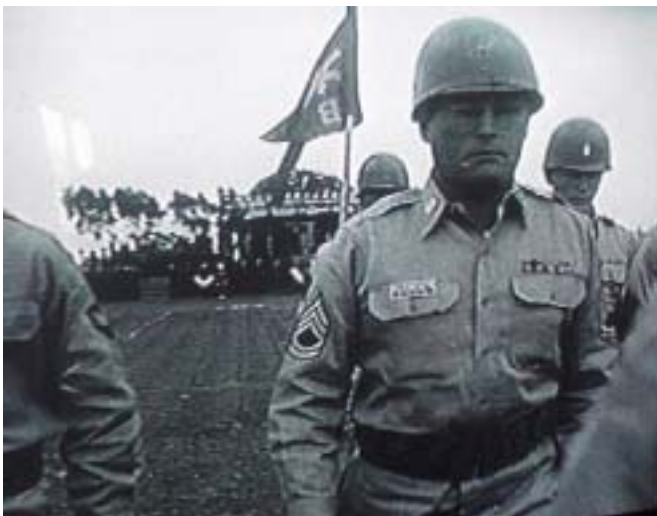
2nd Missile Bn. Troops at the Parade (#10)