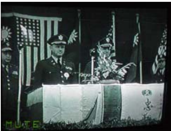
U.S. Officers on Reviewing Stand for parade of U.S. Army and R.O.C. Army Troops