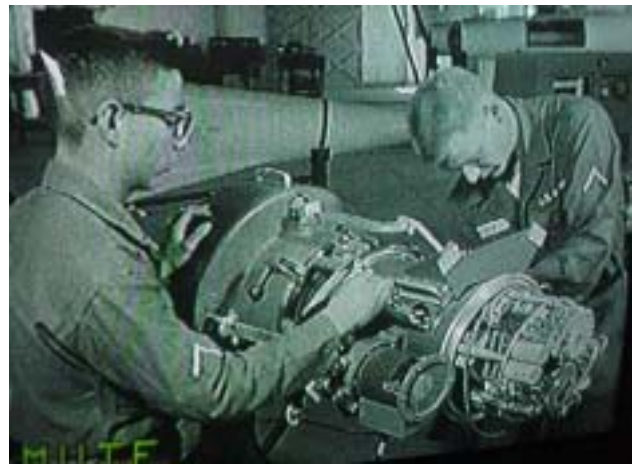
178th Ord Det Maintenance Troops (#1)