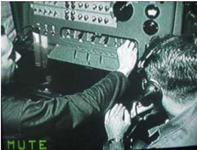
178th Ord Det Maintenance Troops (#4)