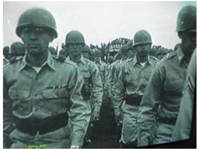
2nd Missile Bn. Troops at the Parade (#3)