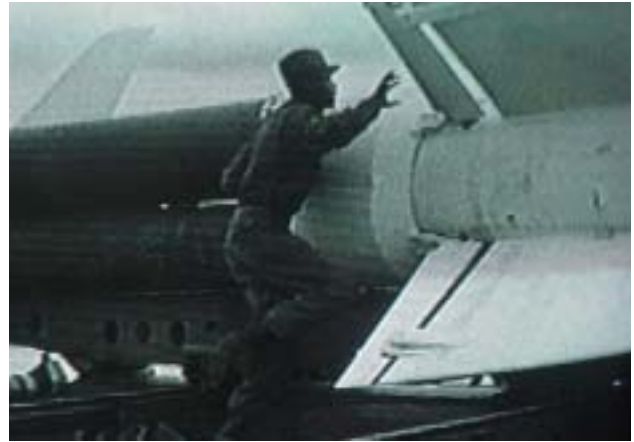
2nd Missile Bn. Launcher Troops (#2)