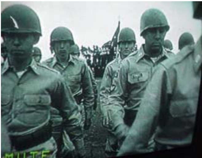
2nd Missile Bn. Troops at the Parade (#8)