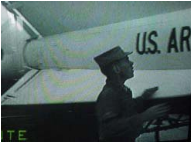
2nd Missile Bn. Launcher Troops (#1)