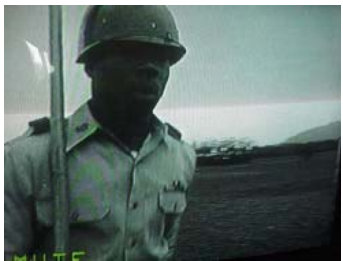
2nd Missile Bn. Troops at the Parade (#11)