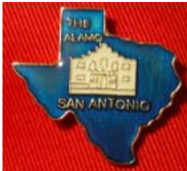
San Antonio Reunion Hat Pin

There will be a lot of time for sightseeing and visiting. There are only a few set activities.