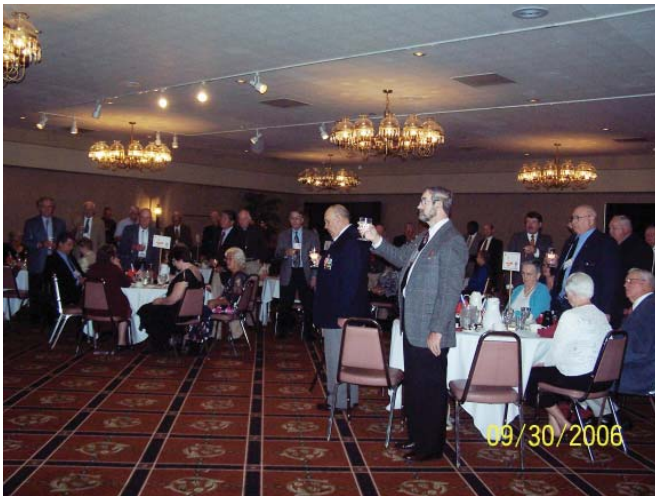
Banquet Toast to Missing Comrades